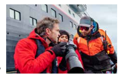
Photo Zodiac availabilities are dependent on weather conditions and schedules according to the Expedition Team. Register interest in the Photo Studio, fees apply.

Utilise the space and freedom of your own private zodiac cruise to take in extraordinary wildlife spotting opportunities and landscapes from a unique point of view, all with the support of a professional photographer. The photo zodiac permits a maximum of two guests at a time to allow for the best photography experience possible.